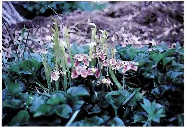
Figure 1: A pink flowered hybrid in cultivation. This specimen was collected by Fred Case and is the cross S. rubra subsp. wherryi × S. alata .

Sarracenia is a genus of insectivorous plants confined to wetlands of eastern U.S. and Canada. Eight species are generally recognized with flower and leaf color ranging from yellow to red. Fertile hybrids occur in the wild under disturbed conditions and can be artificially produced in the greenhouse. Thus genetic barriers between species are weak. Normally when crosses occur or are induced between species or between different color types the progeny exhibit a blending of parental phenotypes called incomplete or partial dominance. In most species all-green mutants have been found which lack any red pigment in leaves, flowers or growth point. Controlled crosses were performed on all-green mutants from S. purpurea and two subspecies of the S. rubra complex. Self pollinated all-green plants result in all-green offspring and self pollinated wild-type red plants result in red offspring. Crosses between red and all-green plants produce wild-type colored red progeny. These results suggest that the red alleles are "dominant" to the "recessive" all-green mutant alleles in the three independent all-green variants tested. Since partial dominance is the usual genetic pattern in the genus, dominant/recessive characteristics are an unusual phenomenon.